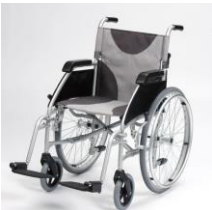
Wheel Chair: $5/hour (Max. $30/day)