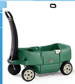
Wagon: $10 Flat Rate

A value added service on your show floor