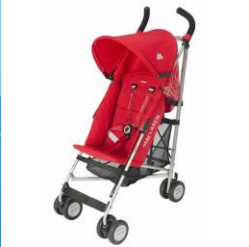
Stroller: $10 Flat Rate