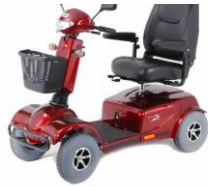
Scooter: $10/hour (Max. $60/day)

We'll do the packing and take care of all the details too, getting your shipment to your desired destinations.