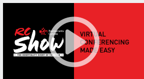
Video 1 MP4