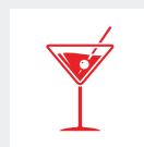
Exhibit Hall Logo W 600px x H 600px (Recommended size)