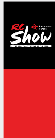
Banner 1 W 783px x H 2000px (Required size)