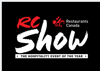
Podium W 1800px x H 1300px (Required size)