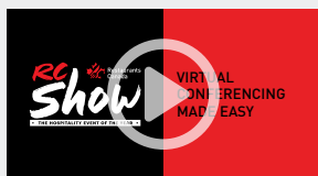
Video 2 MP4