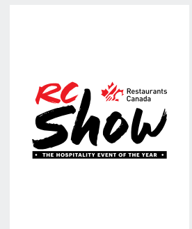
Banner 2 W 783px x H 2000px (Required Size)