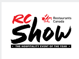
Podium W 1800px x H 1300px (Required Size)