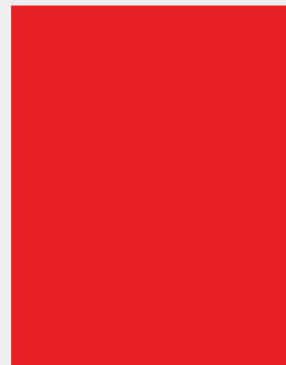
Banner 1 W 783px x H 2000px (Required Size)