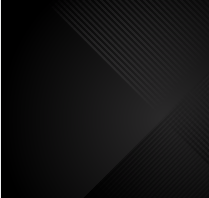
Backdrop Background W 2000px x H 1896px (Required size)