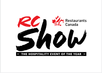
Podium W 1800px x H 1300px (Required size)