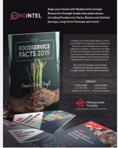
Brochure Cover W 900px x H 1200px (Recommended size)