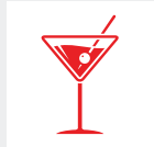
Exhibit Hall Logo W 600px x H 600px (Recommended size)